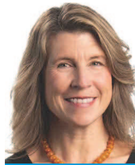
Mayor Kate Rogers

As Mayor of Fredericton, I am deeply honored we can host this significant gathering of Executive Assistants who play an indispensable role in the smooth functioning of local government operations. Your dedication, expertise, and commitment to excellence are invaluable assets to our municipalities, and this Conference serves as a testament to the importance of your contributions.